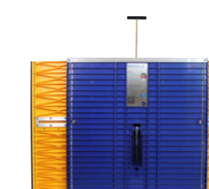
Dam Easy® Flood Barrier expanded position